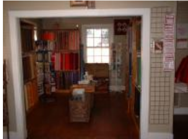
March 2005, first day.

It is hard to believe that it has been a full year since we opened our doors. Thanks to all of you who have entered our lives and made our first year a success. We started out with only 501 bolts of fabric stocked in the 820 square feet of shop space. But we grew to over 1000 bolts of fabric in that same space in less than a year. We have more notions than ever! In four months time we added classes taught by a large pool of talented teachers. We have enjoyed seeing you learn new techniques, seeing people become quilters, and seeing your handiwork.